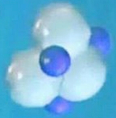
Kangen Water Molecule