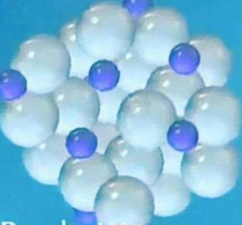
Regular Water Molecule